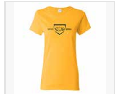
Ladies Heavy Cotton™ 100% Cotton T-Shirt