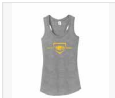
Ladies Perfect Tri™ Racerback Tank