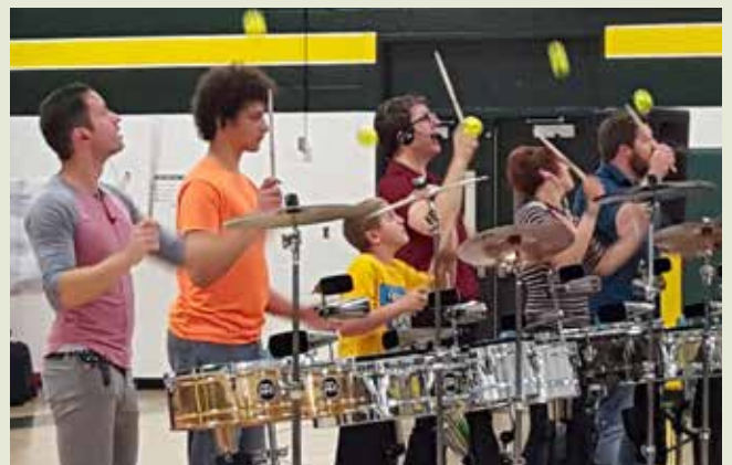
Sheltered Reality, a non-profit drumming group performed at Woodside in April. What a memorable day!