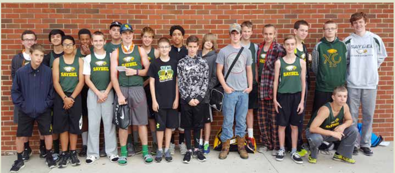
Woodside Boy’s Track Team Competes at State. The Woodside Boy’s Track Team traveled to Ames, IA, this month to compete at the state level. Congratulations to these athletes.