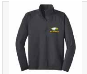
Sport-Wick® Stretch 1/2-Zip Pullover