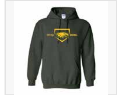
Heavy Blend™ Hooded Sweatshirt