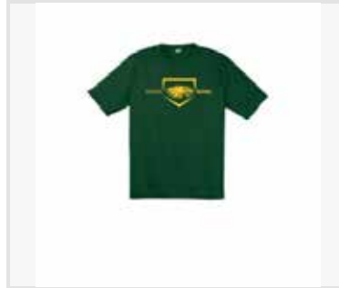
PosiCharge® Competitor™ Tee