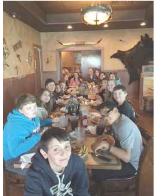
March and April Students of the Month are pictured here enjoying lunch at Montana Mike’s.

Thank you for being leaders in the building!