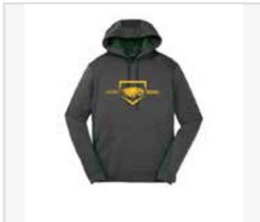
Sport-Wick® Fleece Colorblock Hooded Pullover