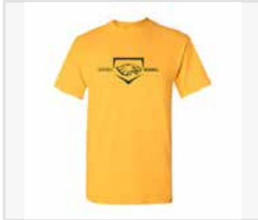
Heavy Cotton™ 100% Cotton T-Shirt

• Orders will NOT be accepted after sale deadline. • If an item becomes unavailable, you'll be notified and your credit card will be refunded.