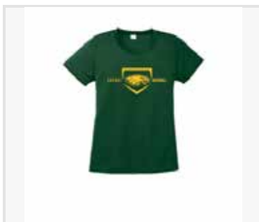
Ladies PosiCharge® Competitor™ Tee