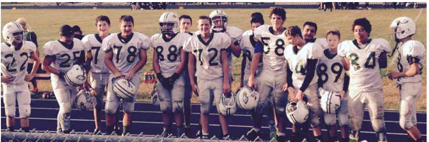
Woodside Eagles 8th Grade Team is pictured here after their win against Collins-Maxwell.

We appreciate your support as a community, and as a coaching staff, we can't wait to watch the amount of success that these kids will have.