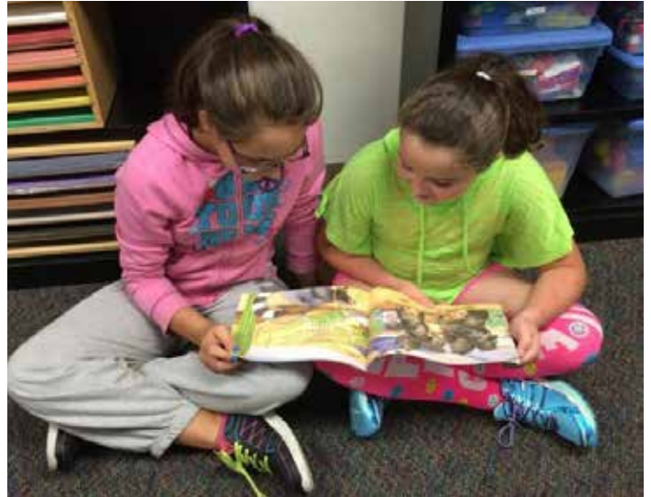
Students engaged in Guided Reading.

In addition to the new materials, teachers continue to work on school-wide strategies. This means that all of our teachers will be working on improving the same math, reading or social skill. Having frequent practice and a consistent message will help your students grow in these skill areas. Our first school-wide skill