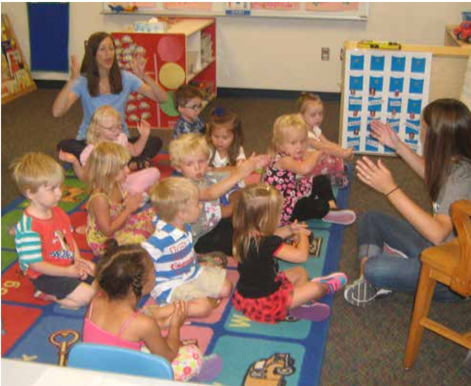
Miss Seidl's three-year-old students love to sing The Wheels on the Bus!