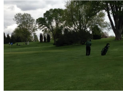
Dylan Hammond chips on #12