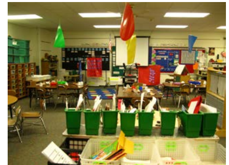
Existing Classroom At Cornell

Stay tuned on social media and local news outlets for upcoming Public Forums, Building Tours, and Other Events leading up to potential September Bond election.