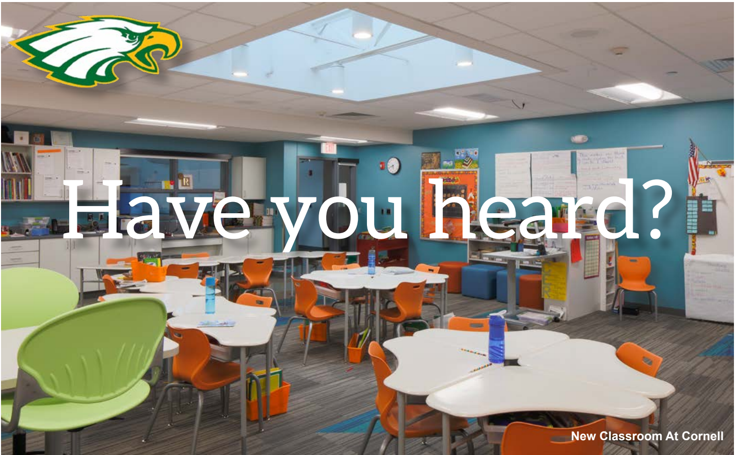
New Classroom At Cornell