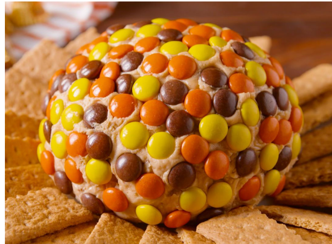
Reese's Peanut Butter Balls