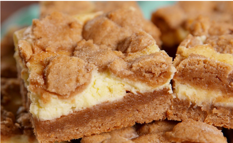
Snickerdoodle Cheesecake Bars