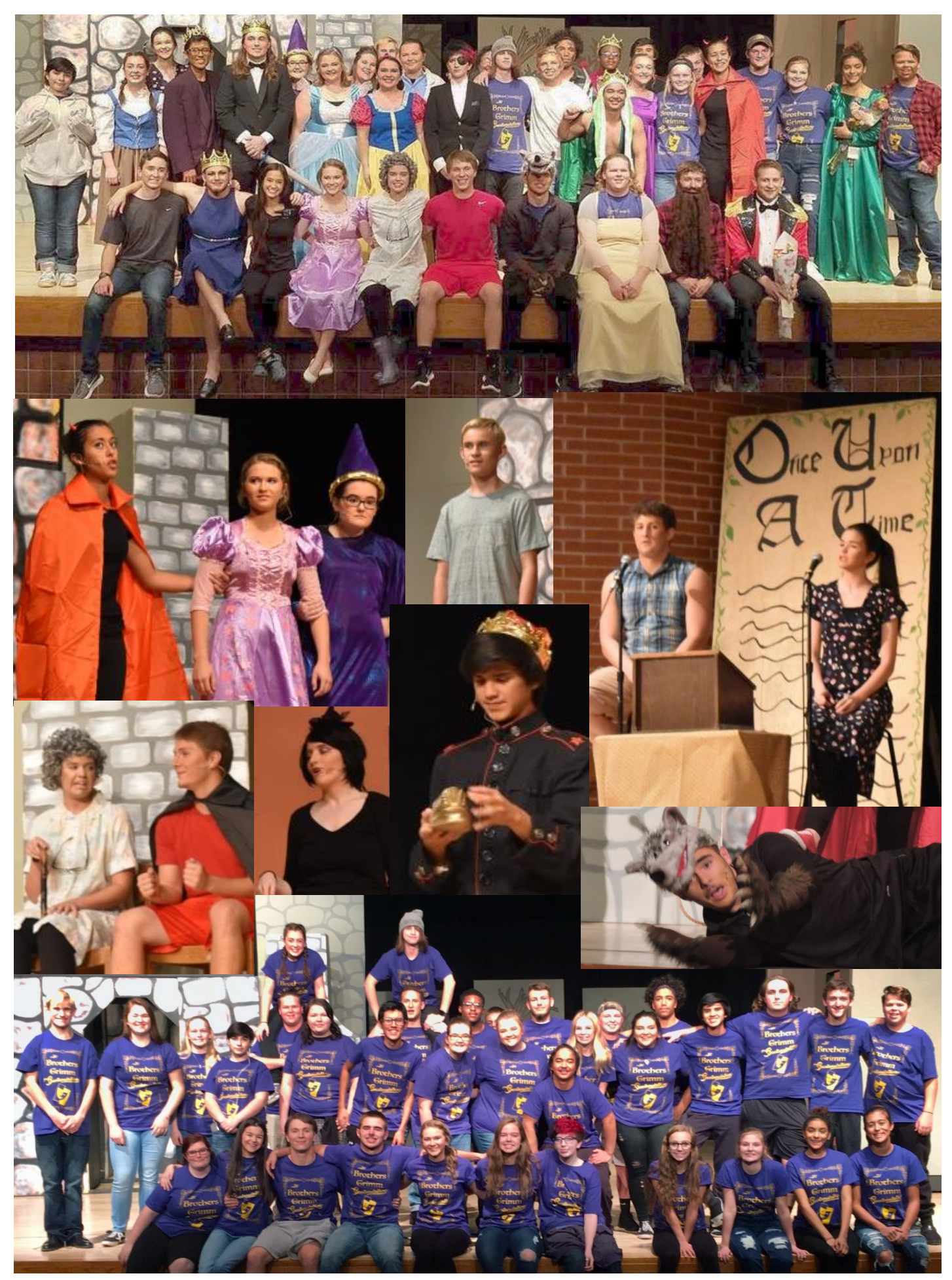
Saydel High School Newsletter Page 8