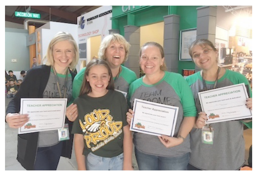
Woodside fifth grade teachers were honored at JA BizTown.