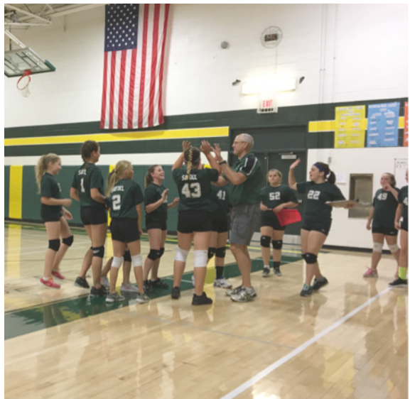
Volleyball players celebrated a great season.