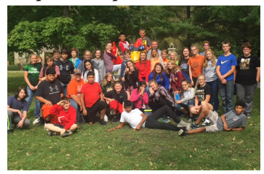
Woodside students visited Iowa State University.