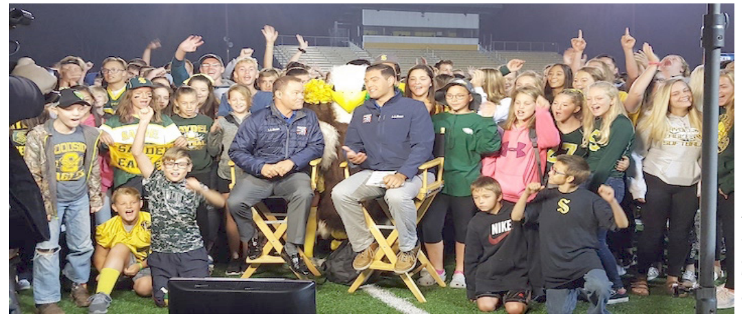
Woodside students attended the Local Channel 5 Game Day event at Saydel High School. This was a great community experience for Saydel.