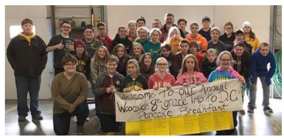
The 5<sup>th</sup> Annual Woodside 8<sup>th</sup> Grade Trip to Washington, D.C., Pancake Breakfast served over 321 guests and raised approximately $180 for each student. The trip is June 6 - 10, 2018.

As a member of the Saydel District, I encourage you to attend these events or look on the district's website and find an event this winter. Your support in the stands and auditorium is always welcomed and appreciated!