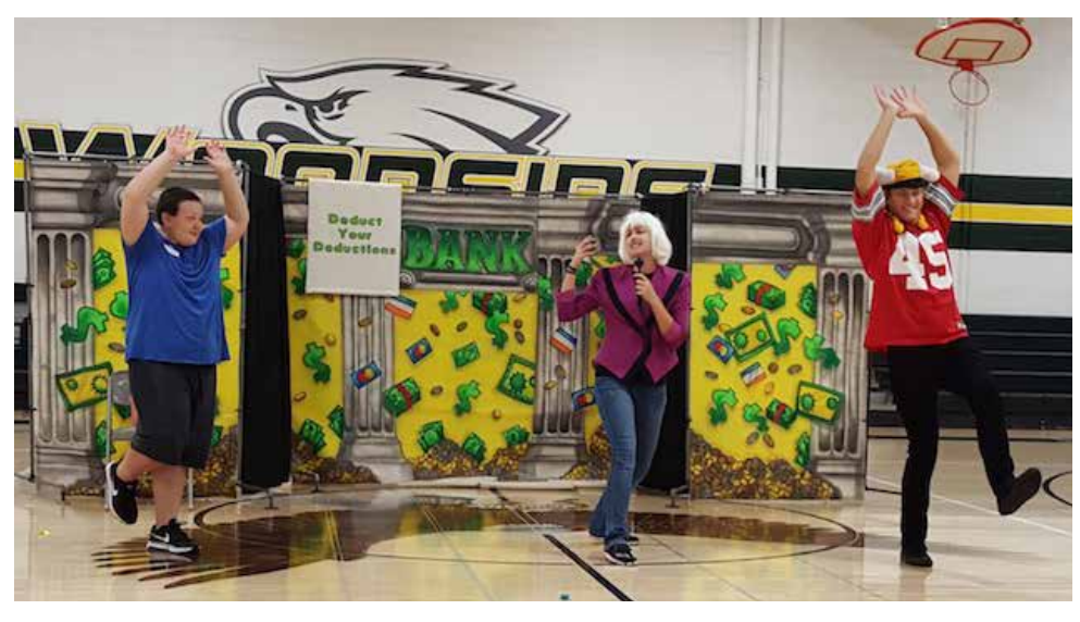
Woodside Middle School Newsletter Page 4