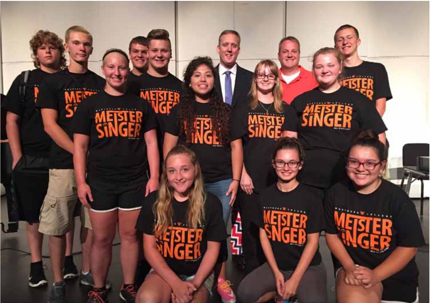
Twelve Saydel High School students attended the Meistersinger All-State Music Camp at Wartburg College in Waverly. The students were in the company of 600 other attendees who spent the three days learning the music for this year's All-State Choir auditions. The evenings provided several social activities for the students who enjoyed the opportunity to relax after such focused rehearsals.