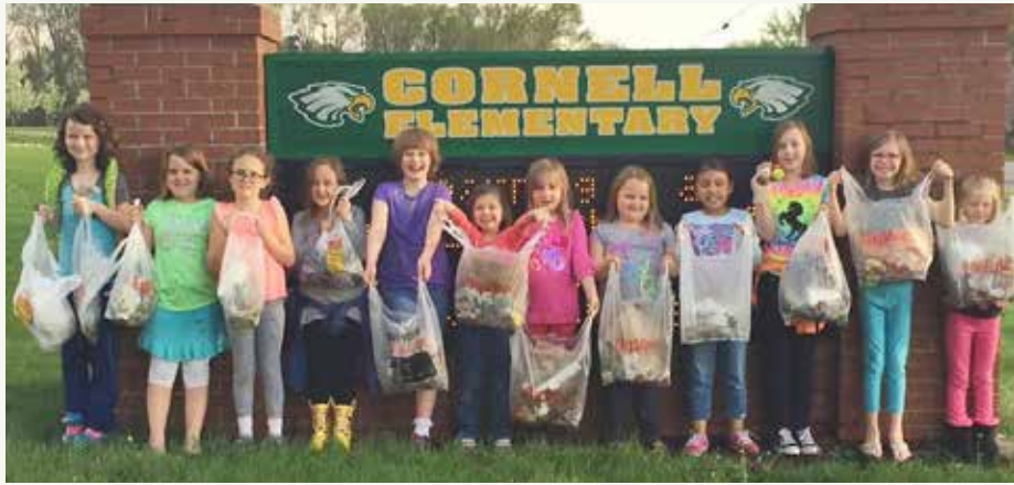
CELEBRATING EARTH DAY! Cornell Elementary Girl Scouts earned their Earth Day Badges by cleaning up the school grounds.